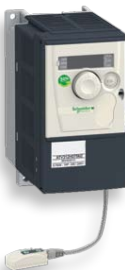
◀ Simple-loader allows you to quickly load the same configurations on several machines

Duplicate the configuration using Schneider Electric's simple loader and multi-loader, or the Altivar 312's bluetooth interface. The multi-loader stores configurations of several drives on a standard SD memory card and allows you to simply load it directly into your PC or drive. The simple loader maintains the settings of single drive for transfer.