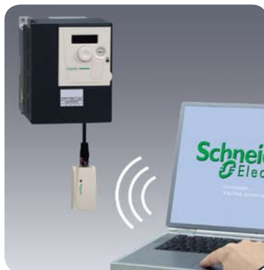
▲ Bluetooth compatible

The Altivar 312 drive integrates seamlessly into your architectures and communicates with all control system products to optimize machine performance. It offers numerous communications options, including Modbus and CANopen as well as option cards for CANopen Daisy Chain, DeviceNet and Profibus DP.