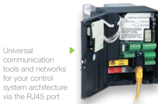
▶ Universal communication tools and networks for your control system architecture via the RJ45 port