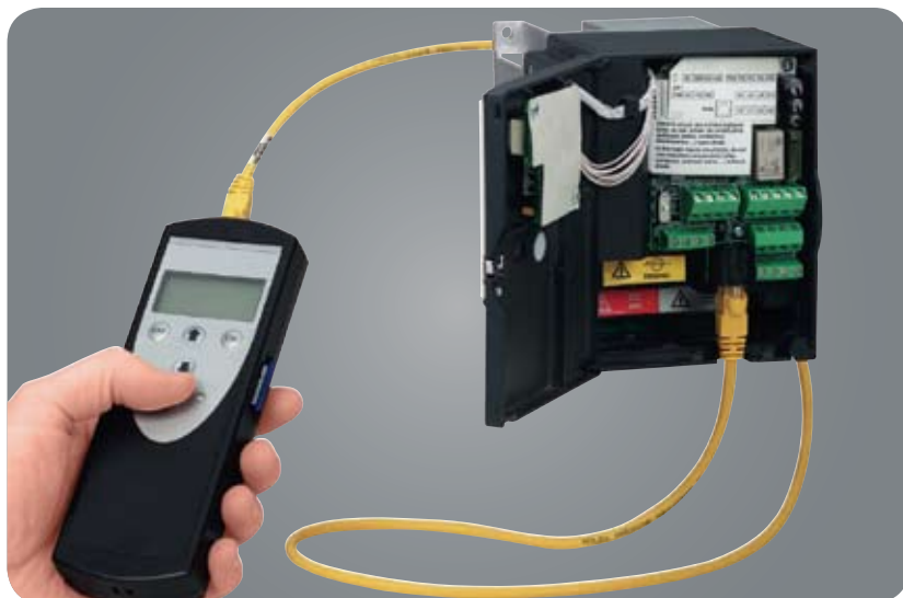
▲ Multiloader stores configurations for multiple drives